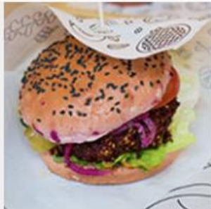
Reduce meat consumption