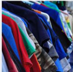
Shop for second hand clothes