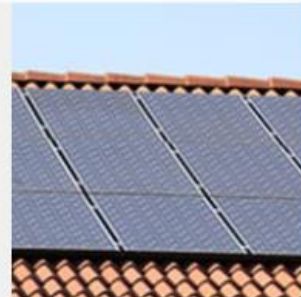
Have solar panels