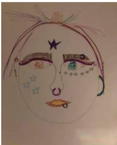
Virtual Escapades - Festival Face

The one thing that we have learned is that Guiding can take place in a virtual environment, which means a bit of “thinking outside the box” to produce activities that the girls enjoyed and could easily take part.