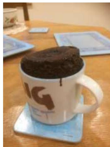
Cake in a Mug