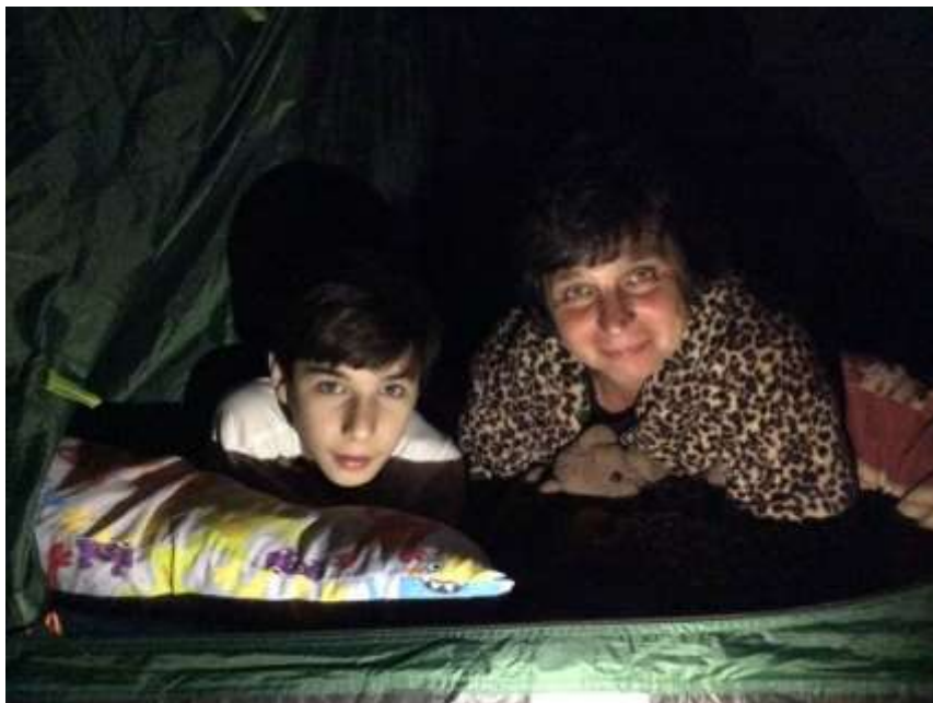
A Ryedale leader and family sleeping out for Link Camp in the Garden